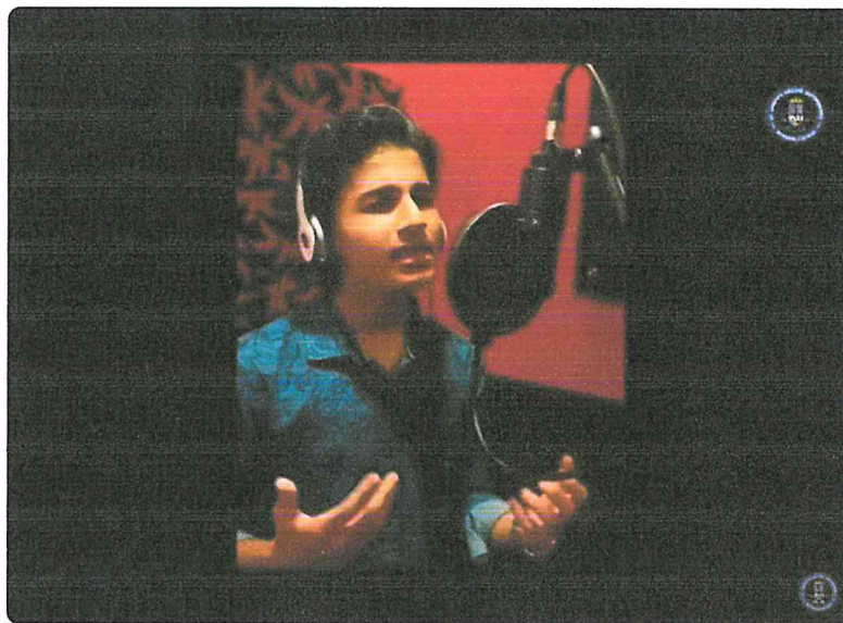
St. Joseph's College (Autonomous) Devagiri | Induction Programme Day 2 | 06-10-2020 |