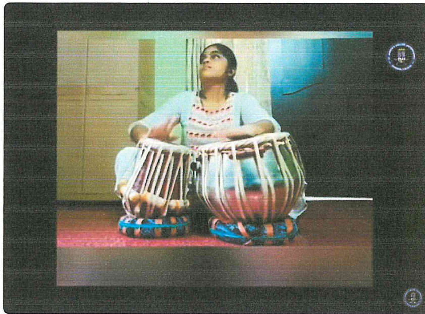
St. Joseph's College (Autonomous) Devagiri | Induction Programme Day 2 | 06-10-2020 |